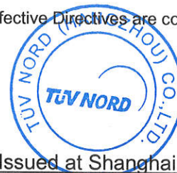
Issued at Shanghai Place, Stamp